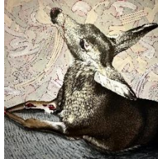
Best of Show 2025 “Buying Time” by Amelia Villagomez

PICK UP YOUR ARTWORK October 31 3:00-5:00PM