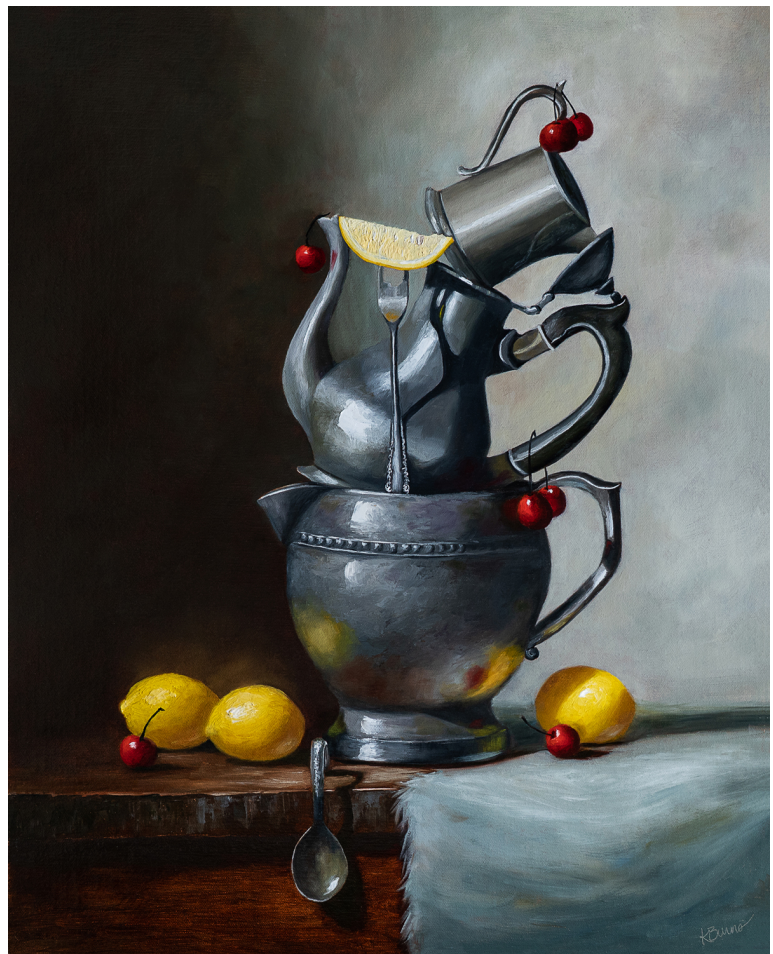
NCA Members Show — Best of Show