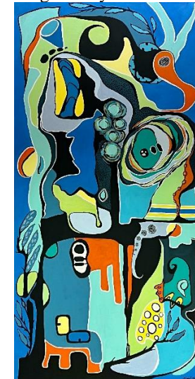
Cheryl Gleason Art

Entries must be submitted digitally ONLINE.